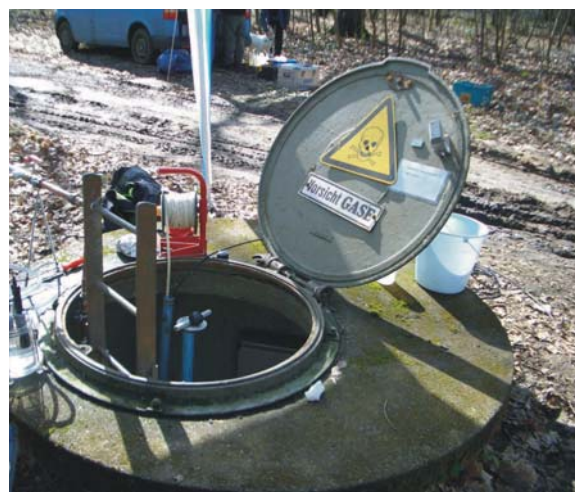
Diagnosis campaign at selected wells: Hydrochemical and microbiological analyses